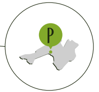
PROSECCO DOCG ZONE